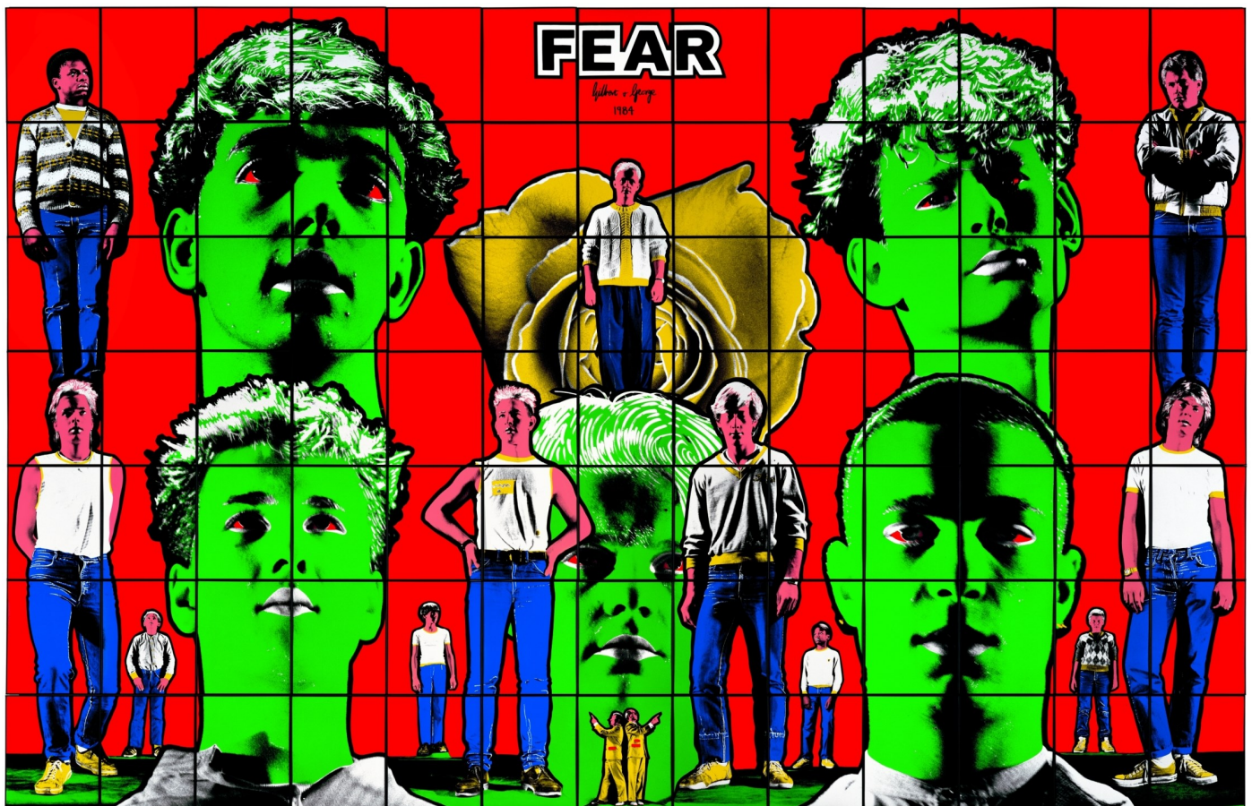
FEAR. 1984. 422 X 652 CM

Gilbert and George are known for shunning most traditional photographic techniques and creating their own style evolving out of sculpture. They use a heavy amount of photo editing and collage work. Their clearly inspired by Dadaism and surrealist art.